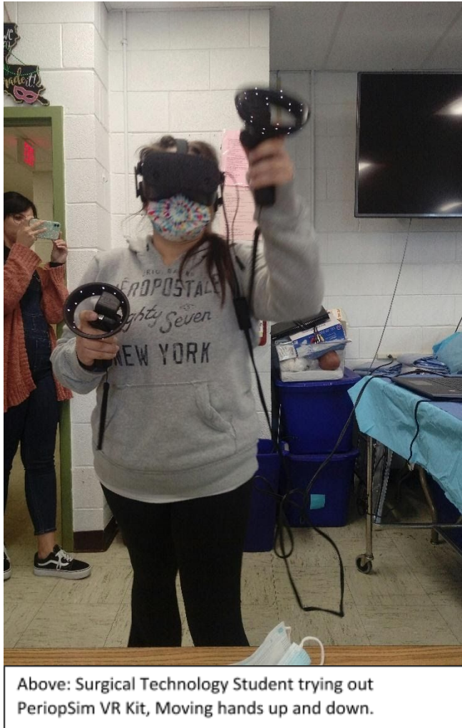
Above: Surgical Technology Student trying out PeriopSim VR Kit, Moving hands up and down.

“The software (PeriopSim VR) knows the instrument was handed wrong and when the hands are dropped below the table. That’s really good, I really like that!”