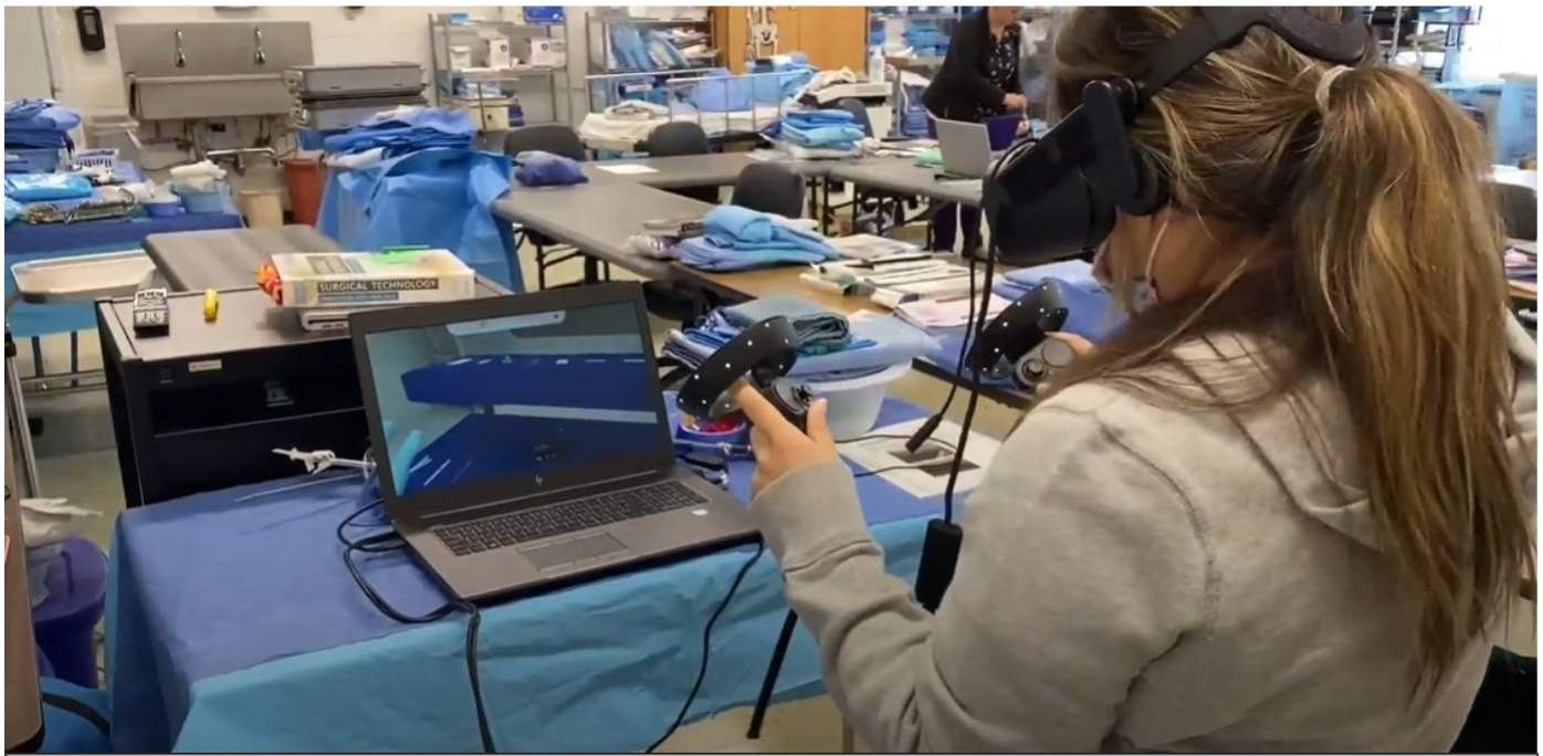
Above: Surgical Technology Student testing the PeriopSim VR kit at James Rumsey Technical Institute 2020.

An important piece of information that can be included in the application process is a reference of other schools successfully using PeriopSim in providing an educational advantage. This information strengthens the application to receive funding from The CARES Act. Currently, PeriopSim is still new to James Rumsey Technical Institute, and the board is still deciding on whether the hours put towards PeriopSim will be put to the completion of the Surgical Technology program certificate.