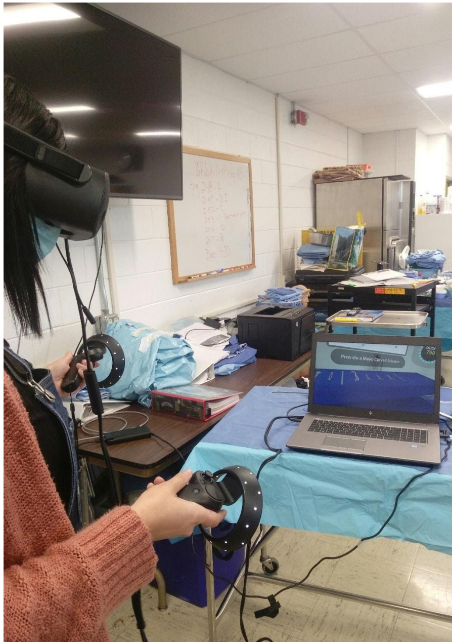
Above: Surgical Technology Student testing the PeriopSim VR kit at James Rumsey Technical Institute 2020.

“It was not just fun, we got to learn from it too!” – Surgical Technology Program Learners, James Rumsey Technical Institute