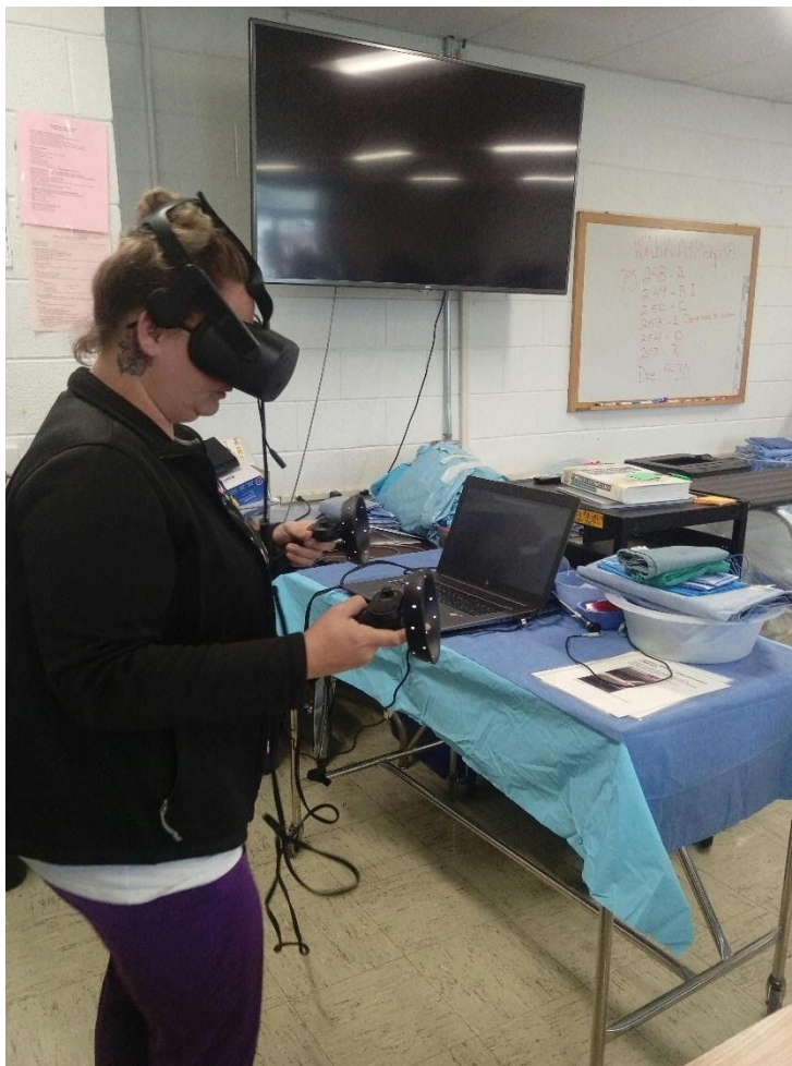
Above: Surgical Technology Student trying out PeriopSim VR Kit